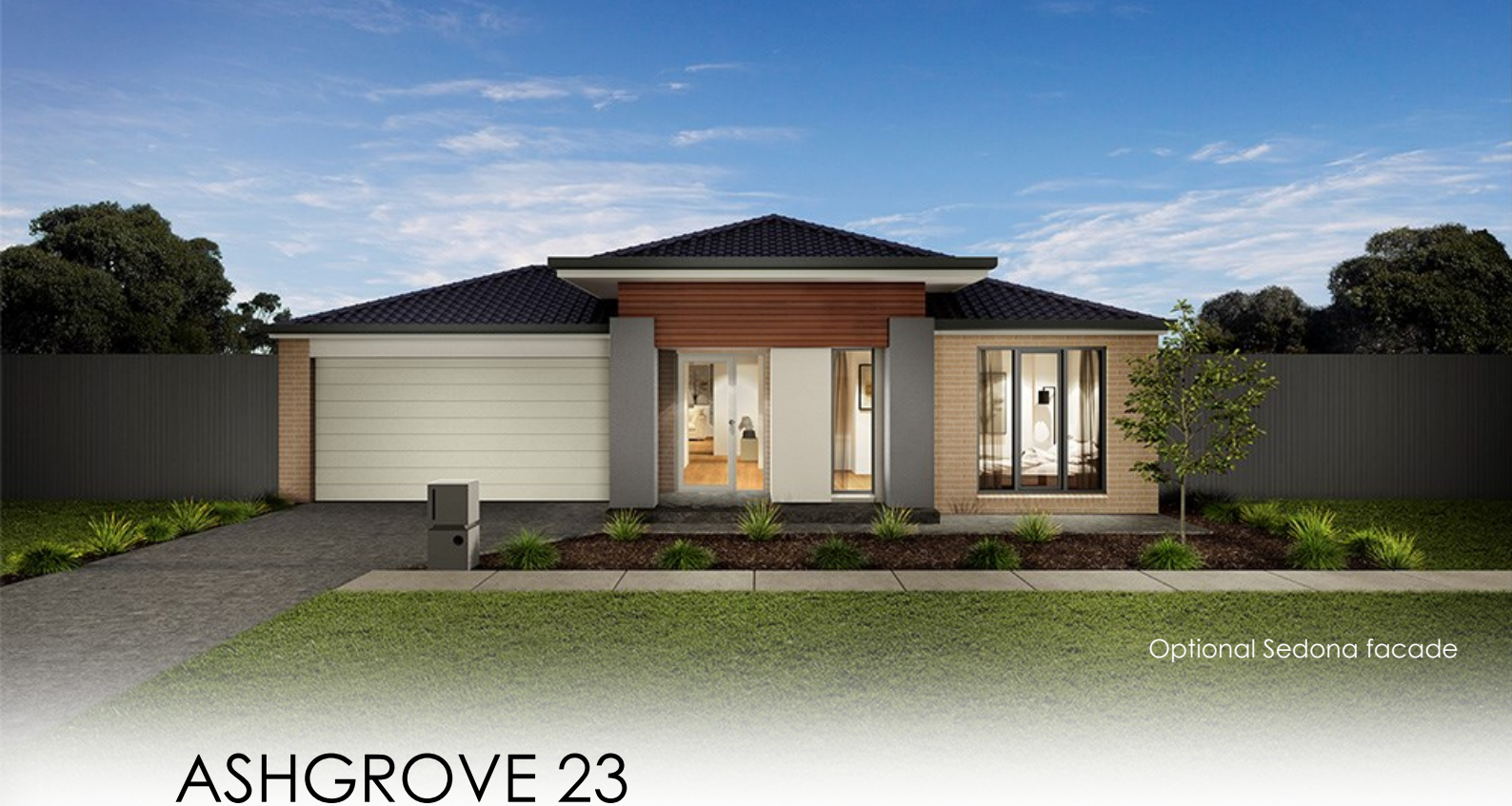
Optional Sedona facade