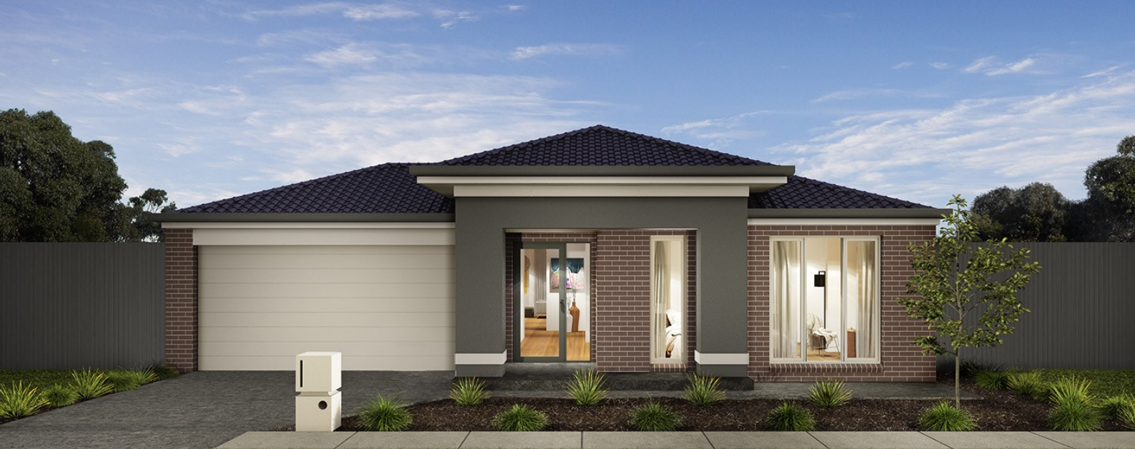
Optional Arcadia facade