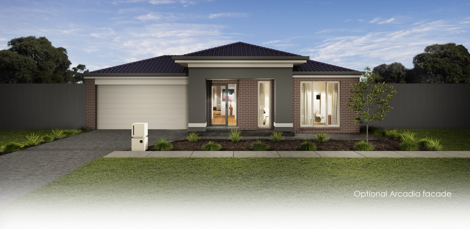
Optional Arcadia facade